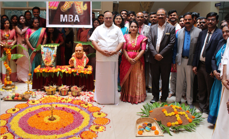
Glimpses of Suggi Sambhrama