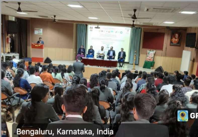
Glimpses of Inauguration and Orientation