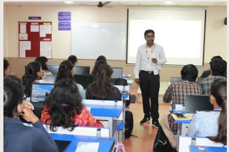
WORKSHOP ON AIML:END TO END DEVELOPMENT ORGANIZED BETWEEN 15TH TO 18TH JULY