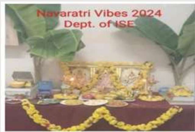
Ayudha Pooja Celebration