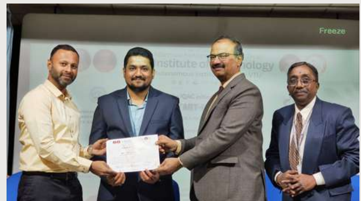
NATIONAL START-UP DAY ORGANIZED ON 16TH JANUARY