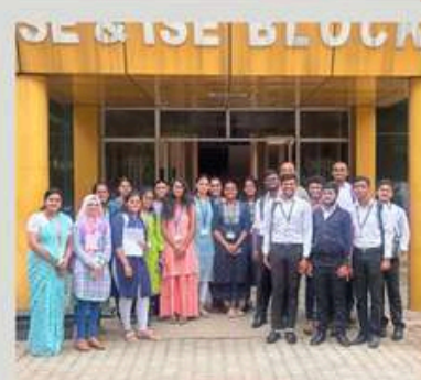
LTI MINDTREE Industry Visit