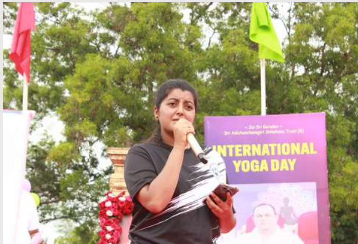
STUDENTS PARTICIPATED ON NATIONAL YOGA DAY