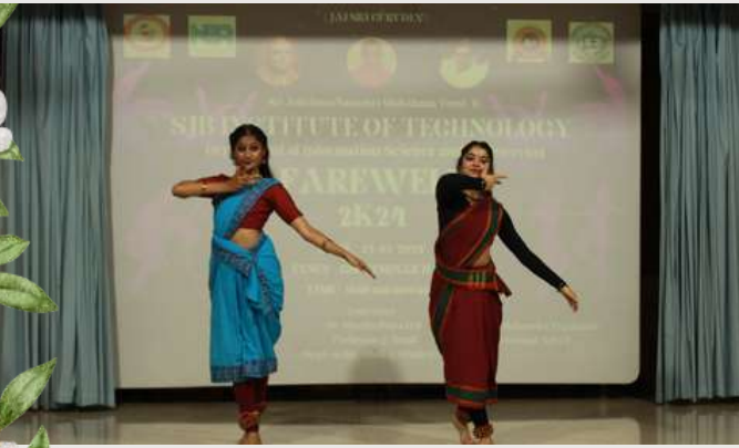
FAREWELL FOR PASSING OUT STUDENTS