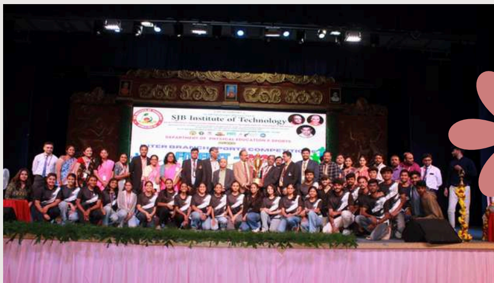
OVERALL CHAMPIONSHIP IN SPORTS