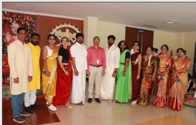
OUR FACULTIES PARTICIPATED ON TEACHERS TALENT'S DAY