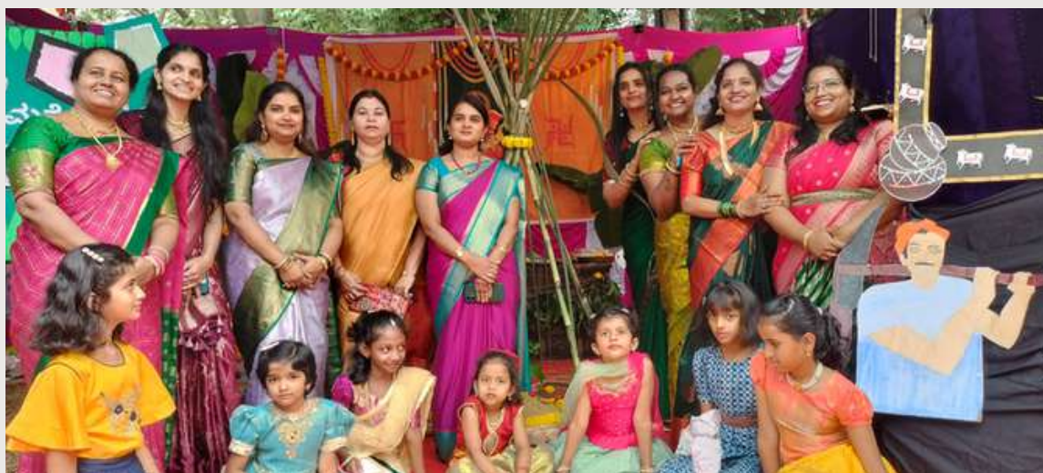
SANKRANTI SAMBRAMA 2025