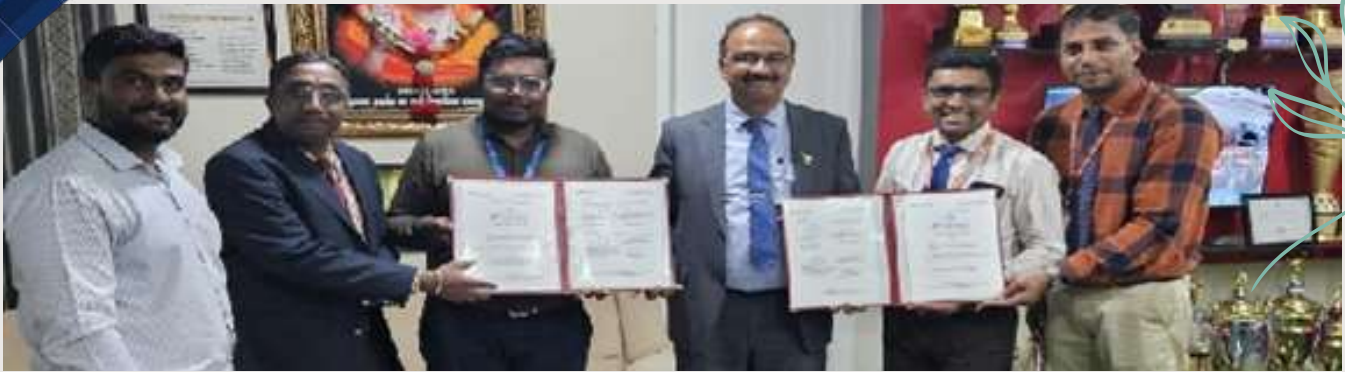
MOU with EXCLR