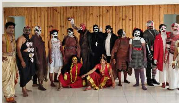
OUR FACULTIES PARTICIPATION IN BGS UTSAV 2024