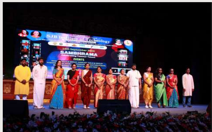
FACULTIES PARTICIPATION IN SAMBRAMA 2024