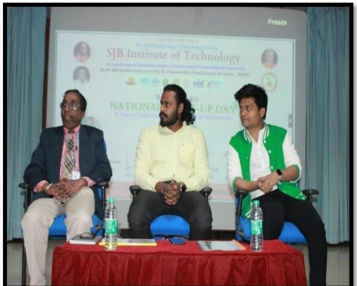
"National Startup Day 2024"