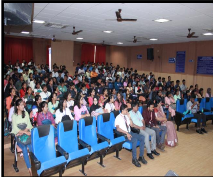
Three days workshop on "Cyber Security and Ethical Hacking: Scope &amp; Future ahead (EHCS-2023)"