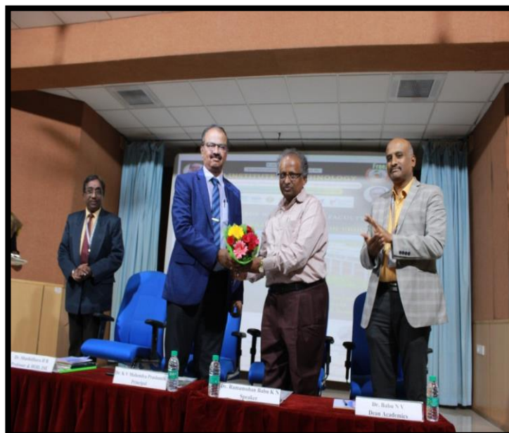
Workshop for faculty on "Demystifying NBA Accreditation Process"