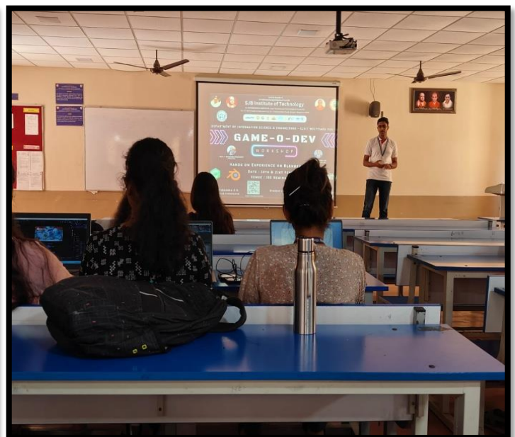
workshop on "Game-O-Dev" for Students