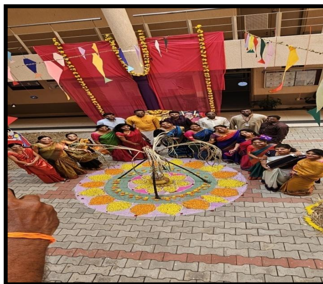
Department of ISE has celebrated "Makara Sankranti" on 17 th January 2024