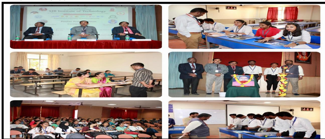
"Poster Presentation Competition"