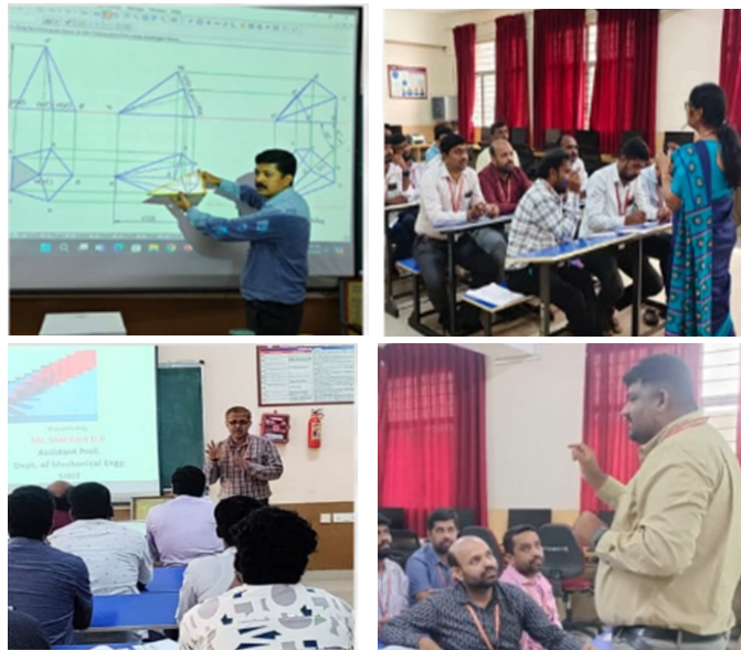
Glimpses of SDP on “Engineering Drawing- Theory & Practice”