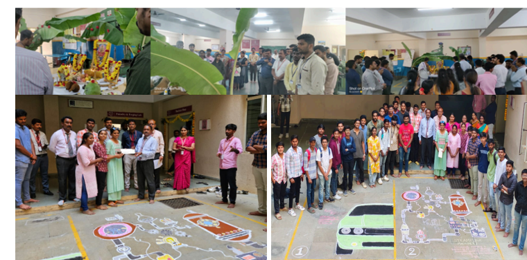
Glimpses of Ayudha Pooja

Mechanical Engineering department conducted Mechanical Machine Rangoli competition on 10th October 2024 as part of Ayudha pooja, students from all semesters participated enthusiastically. Teams were formed within each semester, and the students showcased their creativity by designing Mechanical-Machine Rangoli. The competition aimed to celebrate the spirit of Ayudha Pooja, an occasion that traditionally honours tools, instruments, and machinery, which hold immense significance in the field of Mechanical Engineering.