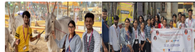
Students at Ayangudi Dhanagala Jatire

As per IIC guidelines, Department of Mechanical Engineering organized a field visit for the First semester students of Computer Science Engineering to Ayangudi Dhanagala Jatire 2025 on 17/01/2025. The visit is aimed to give the exposure to students about animal husbandry, technological solutions for betterment of animals like Cow, sheep etc.