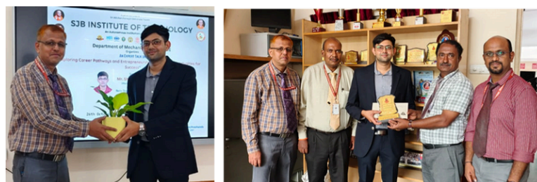
Glimpses of Expert talk on “Exploring Career Pathways and Entrepreneurship: Unlocking Opportunities for Success”

The program outcome provided a foundation for students to build successful careers by integrating their technical knowledge with essential professional skills.