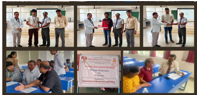
Glimpse of Parents Teacher Meeting

Parents' teaching meeting was conducted in the department on Saturday 09/11/2024 from 10.00am to 12.45pm. More number of parents was participated and expressed their happiness regarding the interest taken by the department about their wards. HOD addressed the gathering and explained about the institution, rules and regulation of the university. HOD felicitated the toppers. Few parents also gave their feedback in the end of the program.