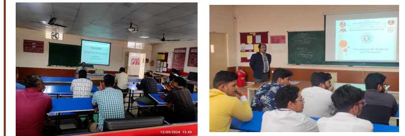
HOD Addressing to Staff & Students

As per the IQAC norms, an orientation session was conducted for all the teaching & non-teaching staff members and also for UG students during the start of the odd semester 2024-25. The HOD addressed the roles & responsibilities, code of conduct and different committees that are present for the welfare of the students. Everyone was strictly informed to abide by the rules & regulations of the department and the college.