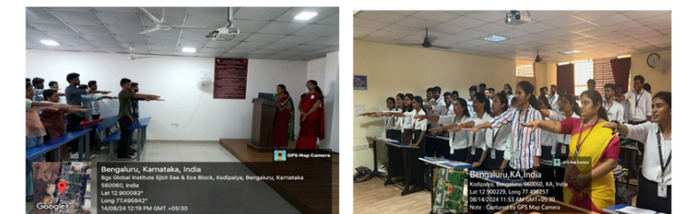
Glimpses of pledge ceremony

The program concluded with a pledge ceremony where all participants took an oath to neither participate in nor tolerate ragging. The Anti-Ragging Awareness Program was highly effective in raising awareness among students. The interactive sessions and personal stories had a profound impact, encouraging students to be proactive in preventing ragging