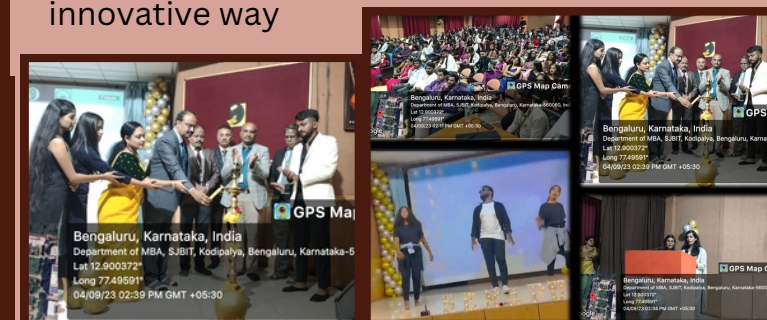
Glimses of Farewell for 4th sem students

"With the blessings of Pujya Swamiji and support from respected Principal sir and HOD, the First Year Students of MBA have organised a Farewell party "Nenapu" to their beloved seniors of second Year MBA on 04-09-2023. Principal addressed the gathering and conveyed his best wishes to all the senior students to have a bright and colourful career ahead and appreciated the first year students efforts in bringing up the event in an innovative way