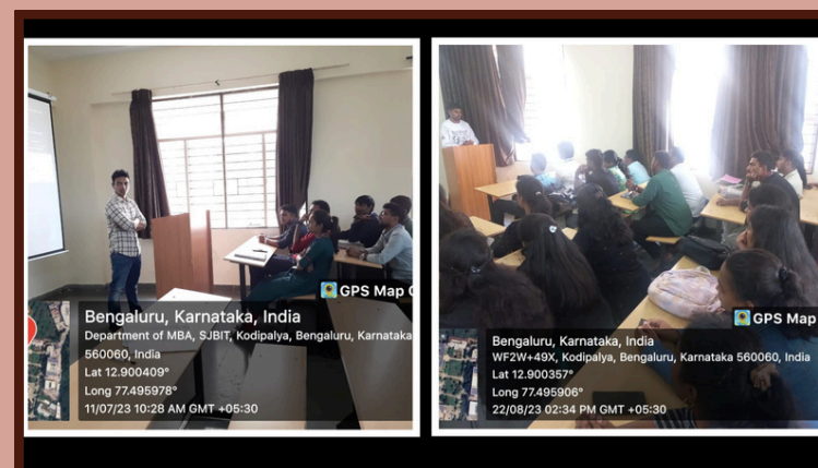
Glimses of Alumni Interaction