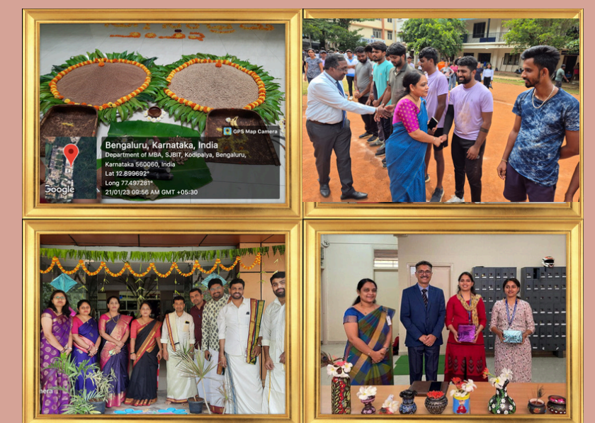
Glimses of Culutral & Sports Events