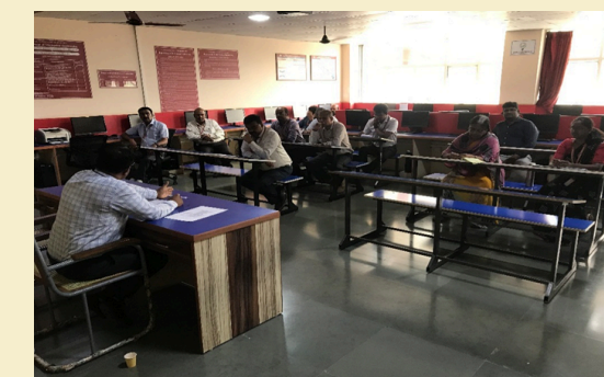
HOD Addressing to Staff & Students

HOD welcomed all the staff to the new session of the upcoming odd semester. He spoke about the trust, institution, and the department. He explained the roles and responsibilities of each staff, DO's and DON'Ts, and department duties. He discussed the status of the internship and project. The orientation program to the staff was conducted on 30-09-2023.