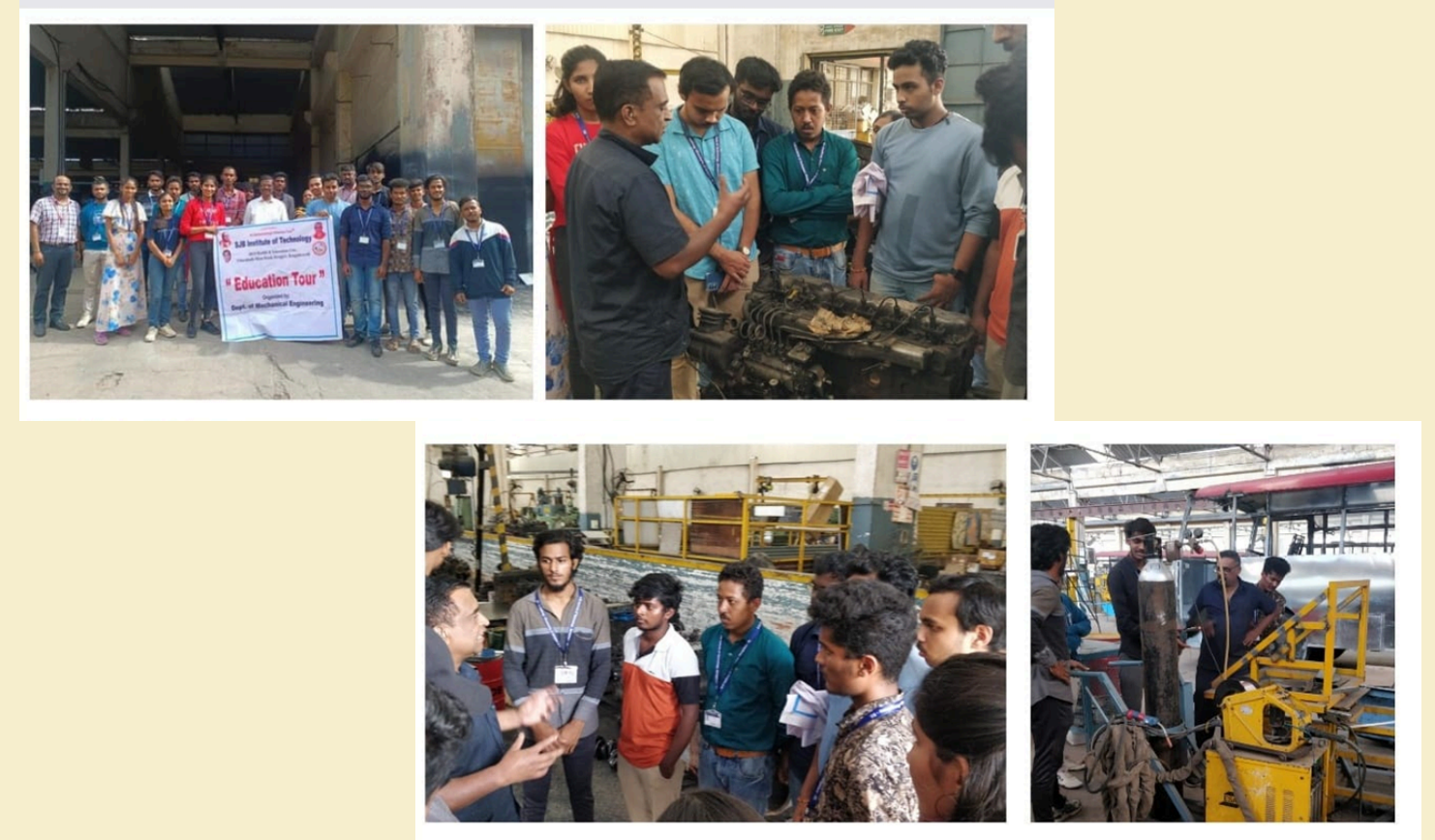
Students at KSRTC Regional Workshop, Bengaluru

An industrial visit was organized for the 4th semester mechanical engineering students on 12th Aug 2023, to the KSRTC (Karnataka State Road Transport Corporation) Regional Workshop. The visit aimed to provide students with practical exposure to various aspects of mechanical engineering and enhance their understanding of real-world applications.