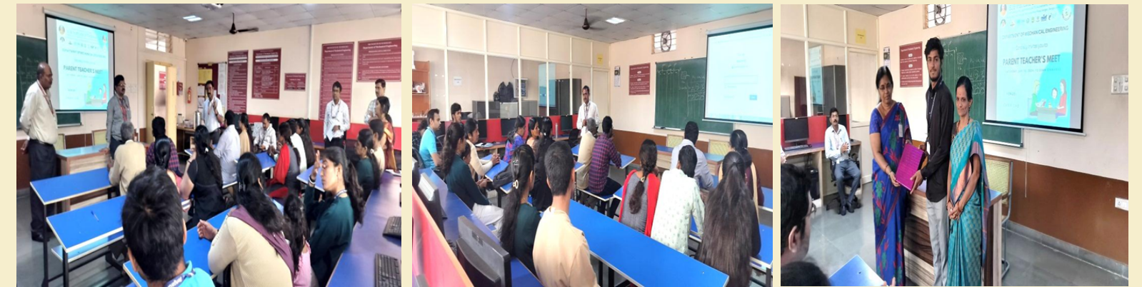
HOD addressing to Parents and Faculty issuing the certificate to student

Parent teacher meeting was conducted at the department on 13th Jan 2024 HOD addressed the gathering and explained on outcome based education, program outcomes, program, educational objectives, NBA, benefits and accreditation formalities the subject toppers from each semester were honored by the respective subject teachers. Later the parents had one to one discussion in detail with the proctors of their wards. More number of parents are participated and expressed their happiness regarding the interest taken by the department about their wards