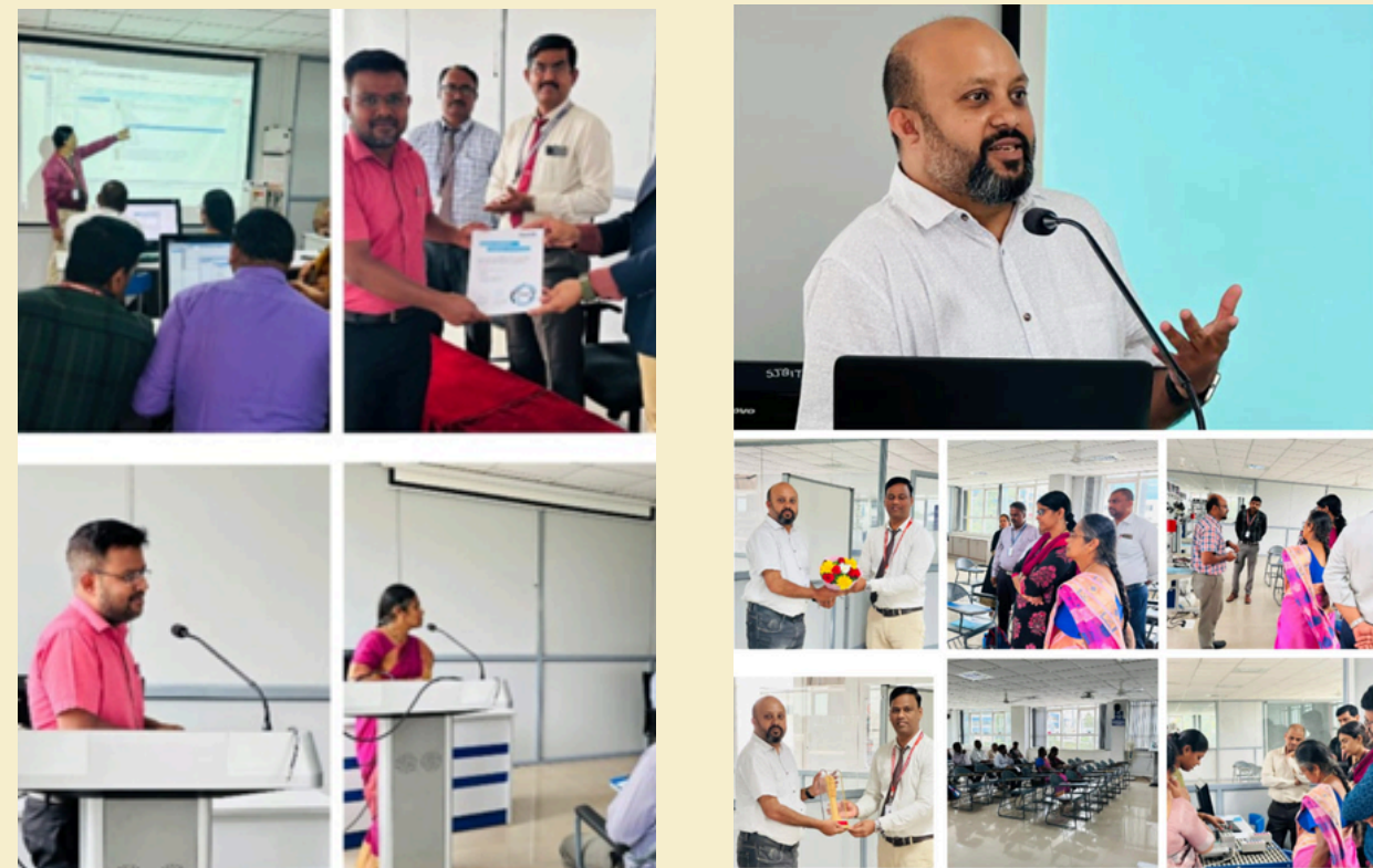
Glimpses of FDP on “Industrial 4.0- Towards Digital Transformation”

One week faculty development program was conducted for all the in-house and external faculty members on INDUSTRIAL 4.0 – TOWARDS DIGITAL TRANSFORMATION” from September 11th to 15th 2022. Speakers were from reputed industries and Academic institutions. This FDP was successfully conducted by Department of Mechanical Engineering along with ECE & EEE department..