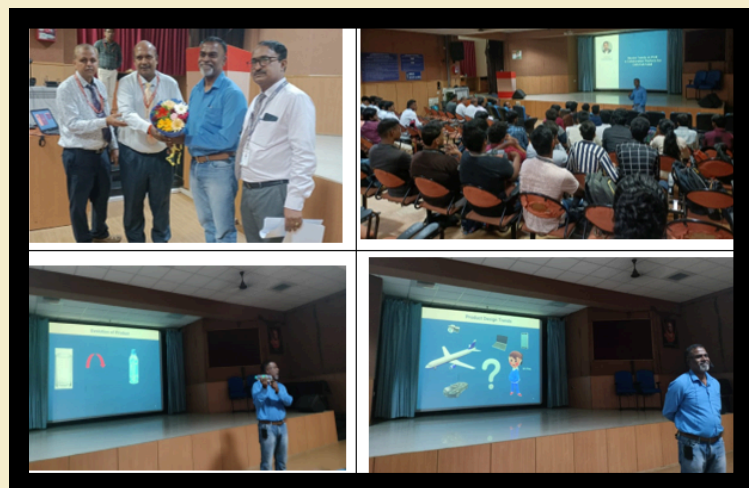
Glimpses of Expert talk on “Opportunities in Emerging Engineering”

Expert talk on “Opportunities in Emerging Engineering” for budding Mechanical Engineers, for 4th, 6th and 8th semester students of Mechanical Engineering, in association with ISTE-SJBIT chapter, was conducted on 07/05/2024, at CSE Seminar hall.