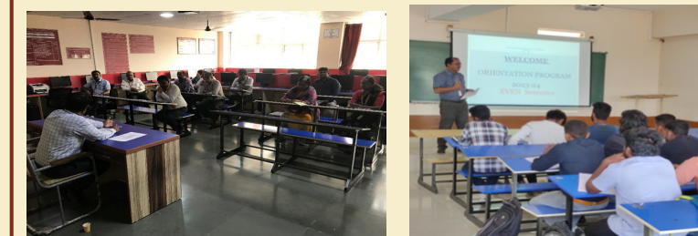
HOD Addressing to Staff & Students

As per the IQAC norms, an orientation session was conducted for all the teaching & non-teaching staff members and also for UG students during the start of the even semester 2023-24. The HOD addressed the roles & responsibilities, code of conduct and different committees that are present for the welfare of the students. Everyone was strictly informed to abide by the rules & regulations of the department and the college.