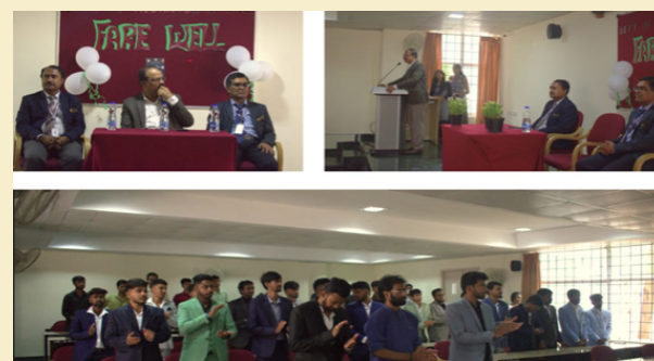
Glimpse of Farewell Function