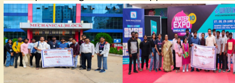
Students at Water Expo ,Bengaluru

As per IQAC guideline Department of Mechanical Engineering organized an industrial visit to the Water Expo Bangalore on 29th June 2024 for the students of the 4th and 6th semesters. The visit aimed to provide students with exposure to the latest advancements in water management technologies and sustainable practices, enhancing their understanding of theoretical concepts through real-world applications.