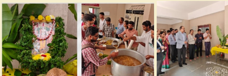
Glimpse of Ram Navami Celebration

Department of Mechanical Engineering celebrated Shree Rama Navami on 17th April 2024 in the Department at 11.30am. The event was attended by Principal, Academic advisor, Deans, HOD's, Academic staff, teaching staff, non-teaching staff and students, all coming together to honor and rejoice the birthday of Lord Sri Rama and to seek his blessings.