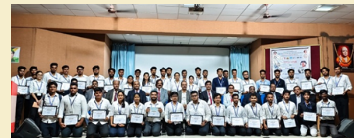
Glimpses of Project exhibition