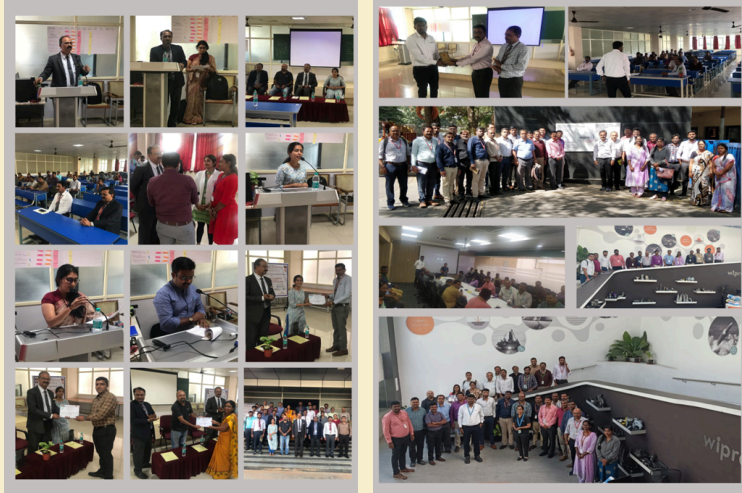
Glimpses of FDP on “Current Technological Developments in Additive Manufacturing” & Industrial Visit to WIPRO 3D, Bengaluru