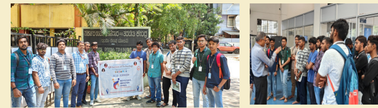
Students at GTTC ,Bengaluru

As per Institution Innovation Council (IIC) guidelines, Department of Mechanical Engineering was organized an field visit for second semester students to Government Tool Room and Training Center (GTTC) Rajajinagar, Bangalore on 26/03/2024. The centre is equipped with advanced CAD LAB, Hydraulics & Pneumatics Labs, Material testing Lab, CNC Trainer Machines and Conventional Machines were demonstrated to students during the visit. The students got insight about innovations, incubation centers, startup opportunities and students got information about advanced research equipment’s availability in GTTC,