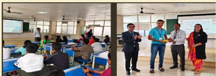
Glimpse of Parents Teacher Meeting

Parents' teaching meeting was conducted in the department on Saturday 25/05/2024 from 10.00am to 12.45pm. More number of parents was participated and expressed their happiness regarding the interest taken by the department about their wards. HOD addressed the gathering and explained about the institution, rules and regulation of the university. HOD felicitated the toppers. Few parents also gave their feedback in the end of the program.