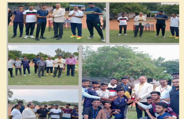
Glimpse of Sports Activity

On May 11, 2024, the Department of Mechanical Engineering organized a Cricket Tournament for all Mechanical students, as well as for the teaching and technical staff. The tournament aimed to promote sportsmanship, teamwork, and camaraderie among the department's members, providing an opportunity for relaxation and interaction outside of academic activities.