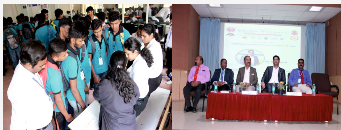
Student visitors on the open Day Event held in SJBIT & Invited Talk Session graced by Principal & HODs