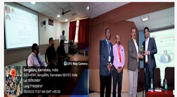
Valedictory Session and Token of Gratitude by ED Cell to Speaker from our Principal, SJBIT