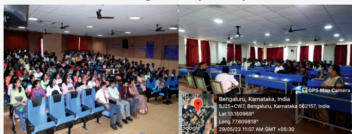
Second-year student's participation in Guest Lecture Event held in Seminar Hall