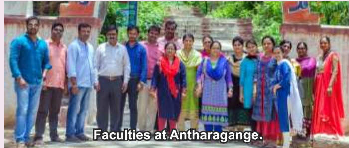
Faculties at Antharagange.

The Department has organized one day excursion to "Antharagange" on 02/08/2017. All our faculties actively took part and had a lot of fun and it was refreshing too.