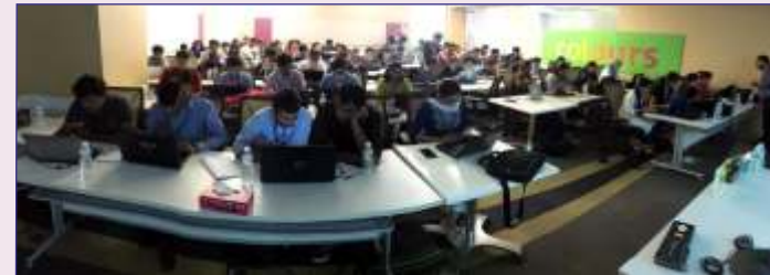
Workshop on Artificial Intelligence