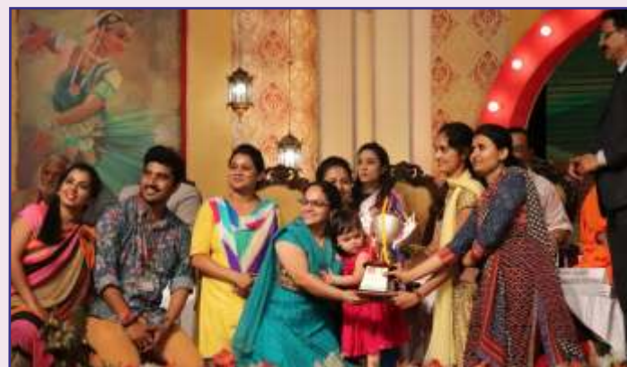
In Faculties Dance competition SJBIT won 2nd prize