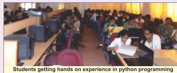
Students getting hands on experience in python programming