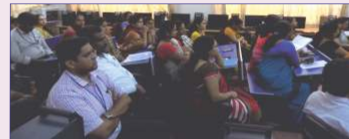
Orientation programme for Faculty