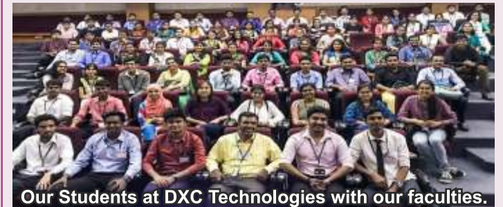
Our Students at DXC Technologies with our faculties.

Our Students at DXC Technologies with our faculties.The Department had organized an industrial visit to DXC Technologies, Bengaluru, on September 28th 2017 for 5th semester students. There were 90 students accompanied with two faculty members, it was an informative and more helpful to the students being at DXC Technologies, Bengaluru.